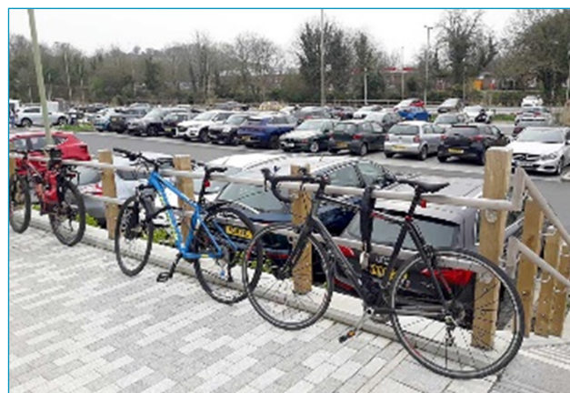
Response to inconvenient and unsafe bike park at WSLC