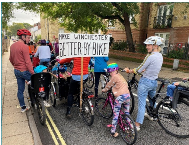
Mass Ride 6, 01/10/22